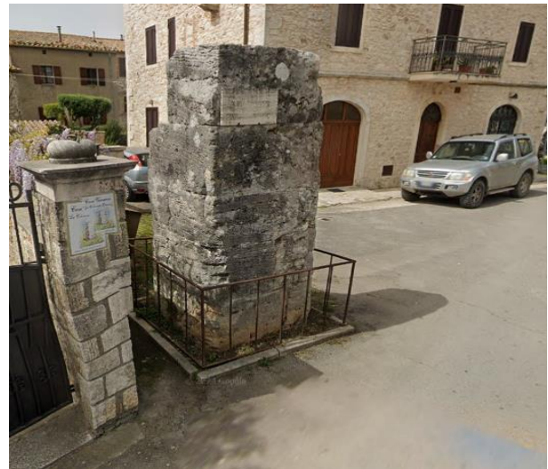
30 Roman ruin

Project carried out with the contribution of the