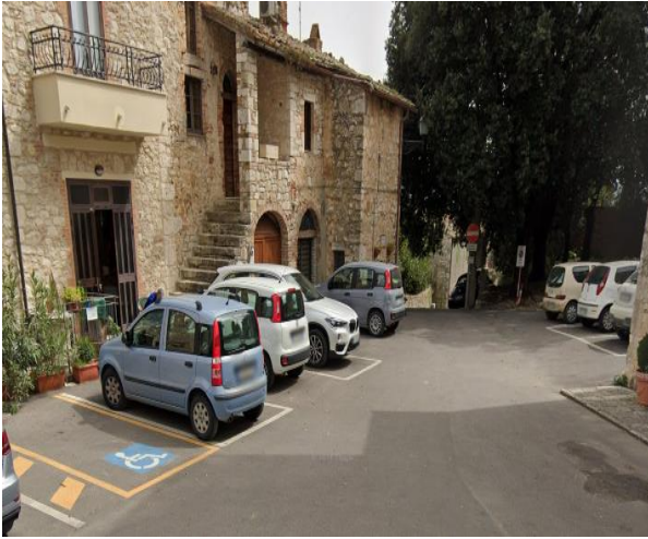
6 Reserved parking space in front of the church