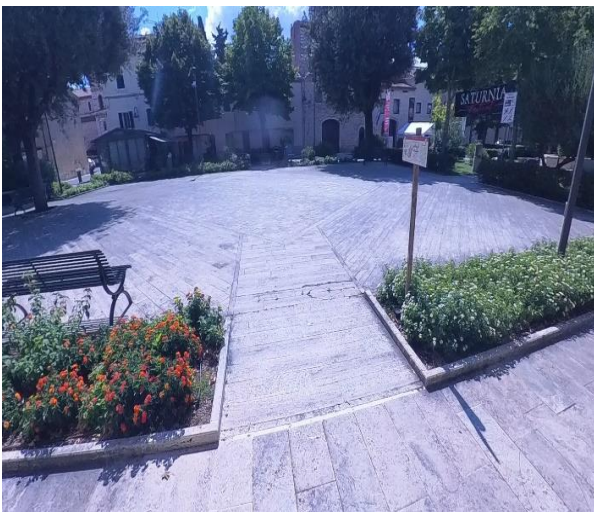
19 Access to Piazza V. Veneto on the flat