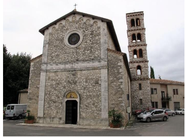
7 Façade of the church of S. Maria Maddalena and entrance portal