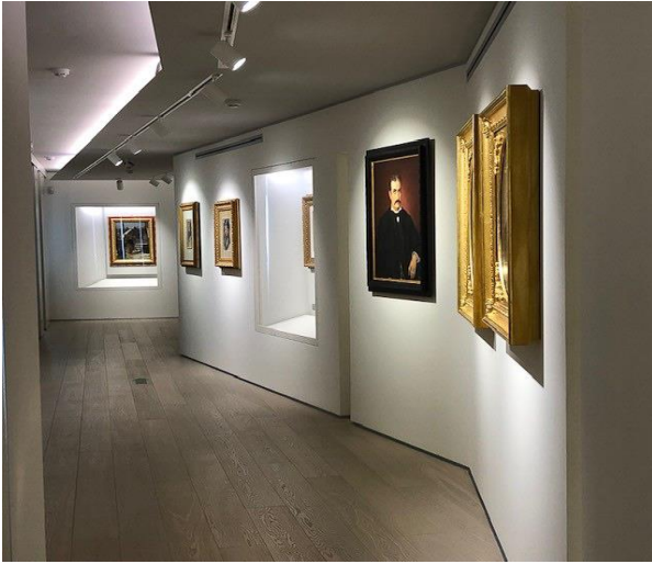
20 Exhibition Centre