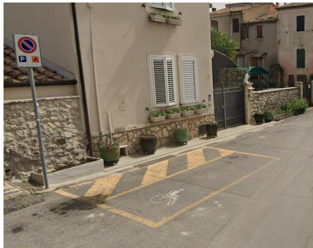
3 Reserved seat

Project carried out with the contribution of the