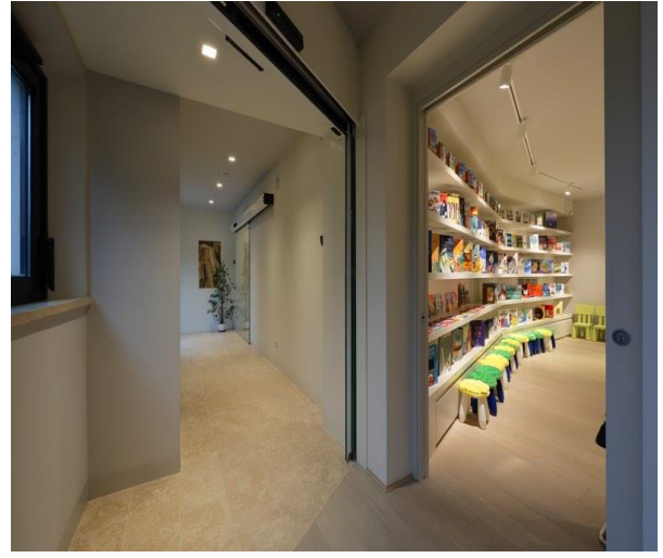
214 Exhibition Grounds