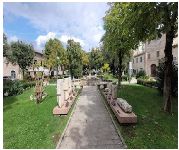
20 Piazza V. Veneto

Project carried out with the contribution of the