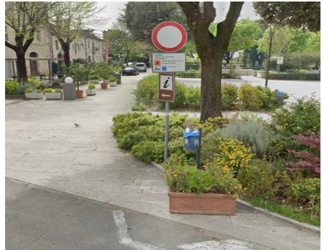
5 entrance Piazza V. Veneto