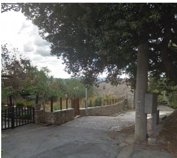
Figure 13 Path to the Porta Romana

Going down towards the Porta Romana, the path is very bumpy and with a ramp of about 30 meters with a slope varying from 7.5% to 20% so it is advisable to admire the archaeological site from the most stable point (a little before the stone house, on the left)