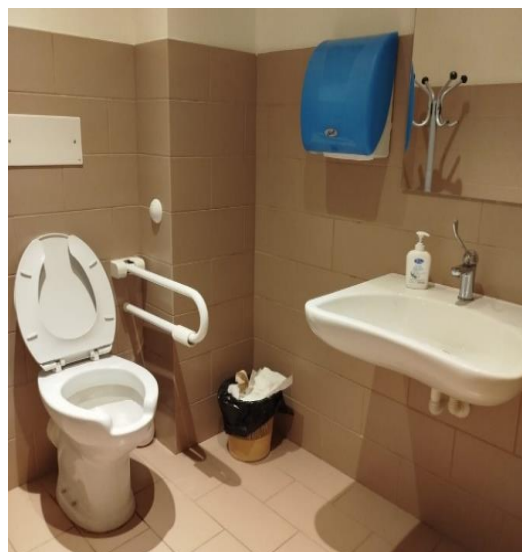
32 toilets with grab bar26

Project carried out with the contribution of the