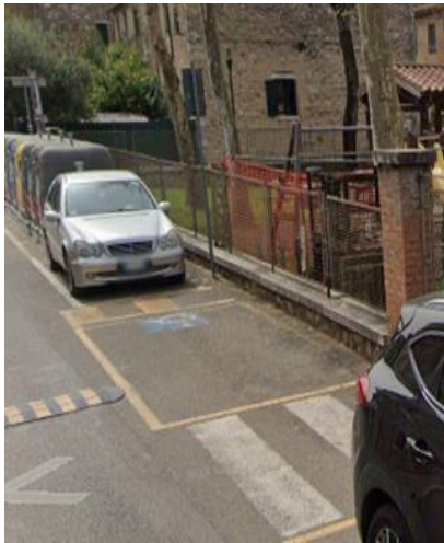
4 Reserved parking