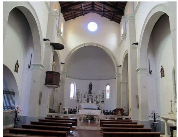
9 Church interior

Project carried out with the contribution of the