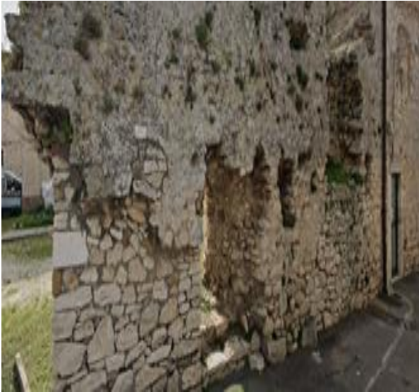
27 Roman ruins24