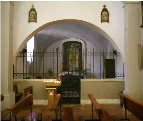
10 Chapel of the Virgin

To reach the gate of the old Sienese Fortress, you walk on an asphalt stretch and a further stretch on dirt road that is fairly regular and well beaten.