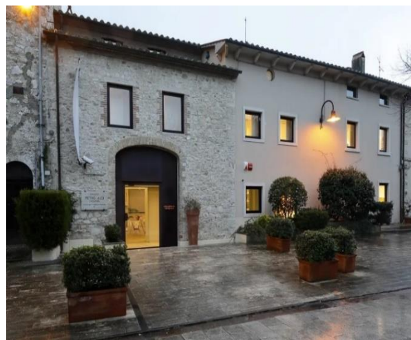
19 Polo Pietro Aldi