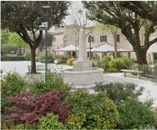
17 Fountain of Piazza V. Veneto