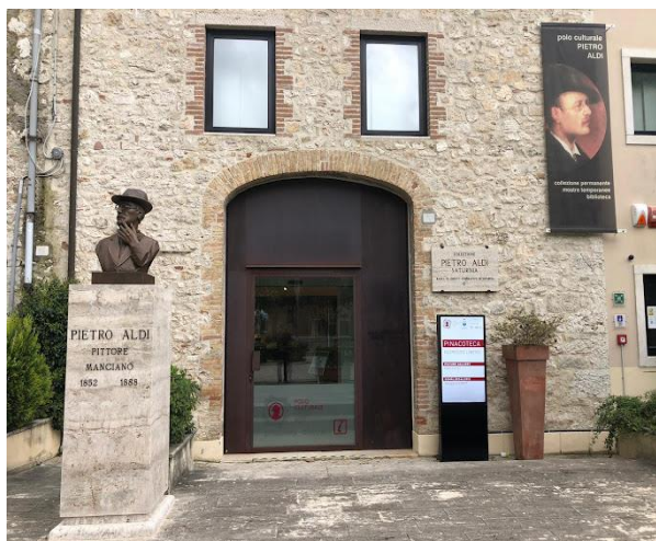
21 Entrance to the Pietro Aldi Campus