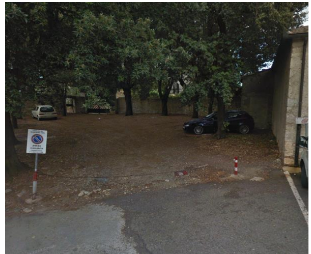
11 Dirt road before the Gate of the Rock

Project carried out with the contribution of the