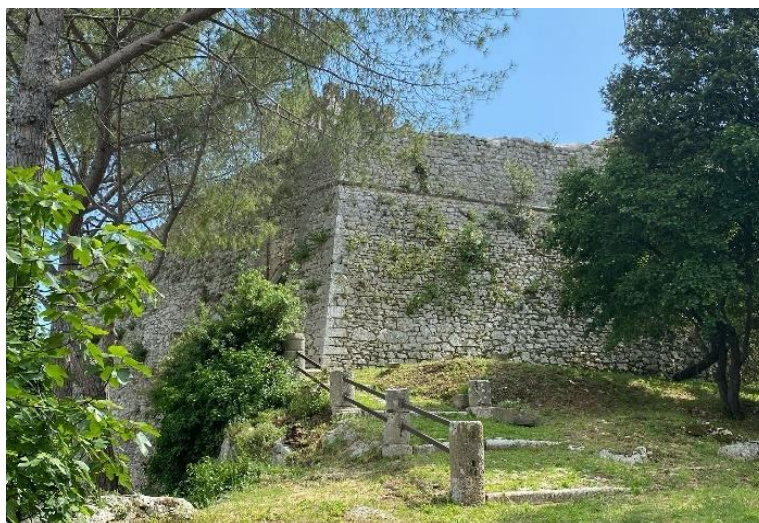
12 Rocca Senese

From here go back in the direction of the church, turning right. The first asphalt route becomes paved at a certain point.