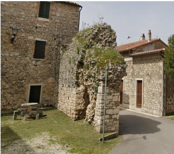
29 Roman ruins