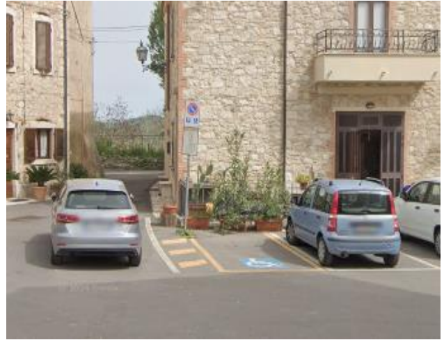
2 Reserved seat