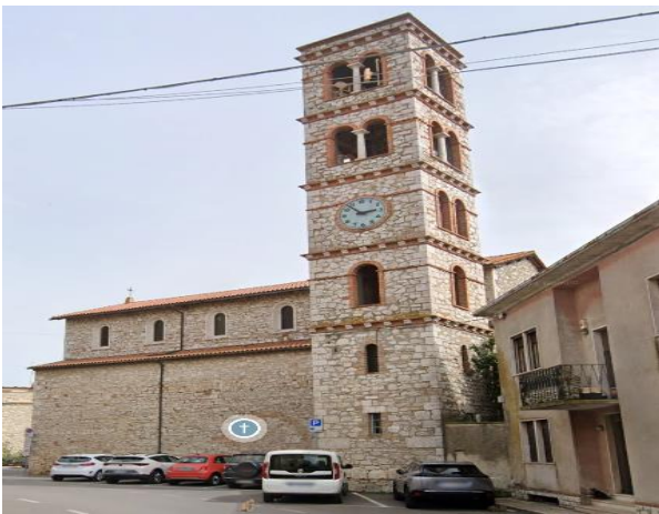
8 bell tower