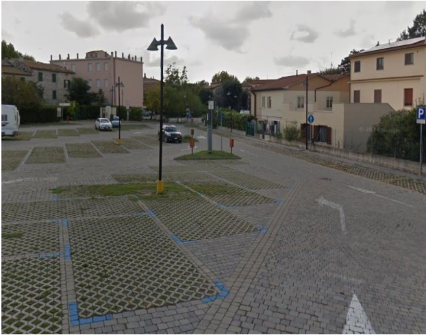
1 Public parking