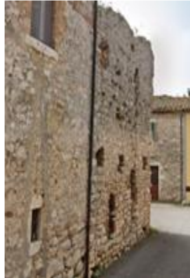
28 Roman ruins25