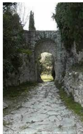
144 Porta Romana